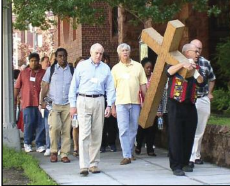
Stations of the Cross on the streets of Washington, DC.